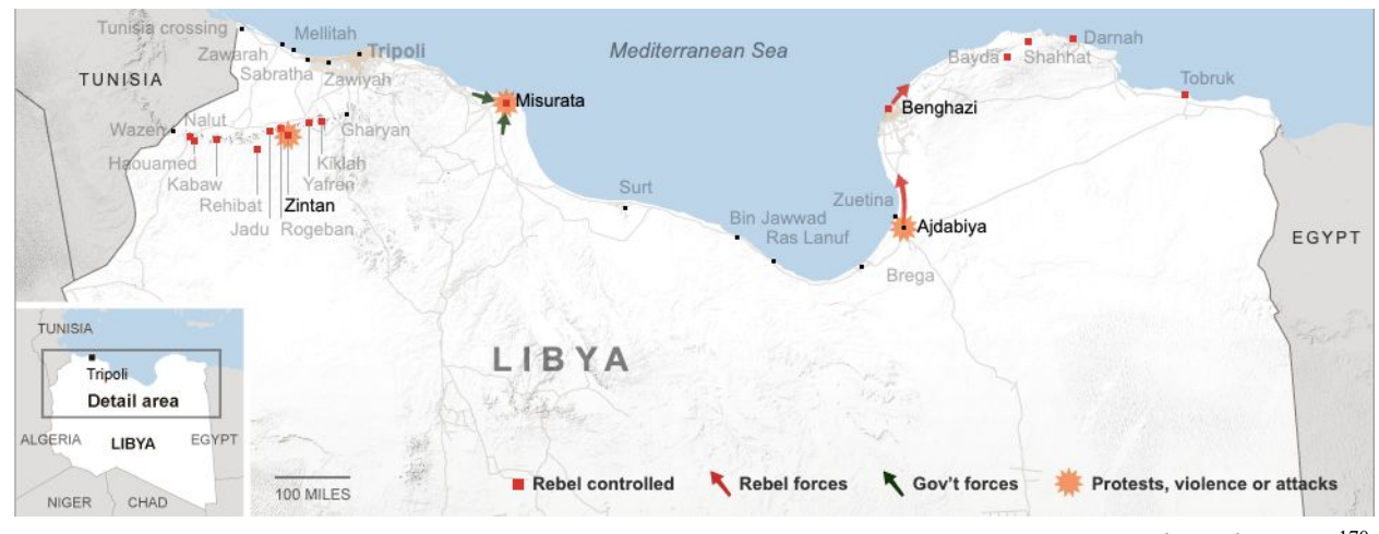
March 16th, 2011<sup>170</sup>

Alan Kuperman argues that, had NATO not intervened, then the conflict would have been over in six weeks rather than eight months. <sup>167</sup> According to the New York Times map of troop movements, it is true that some rebel forces were retreating. <sup>168</sup> However, conflict raged on in Western Libya. <sup>169</sup> Thus, it may be true that part of the conflict would have died out after six weeks, it is questionable whether or not the rebellion as a whole would have ended.