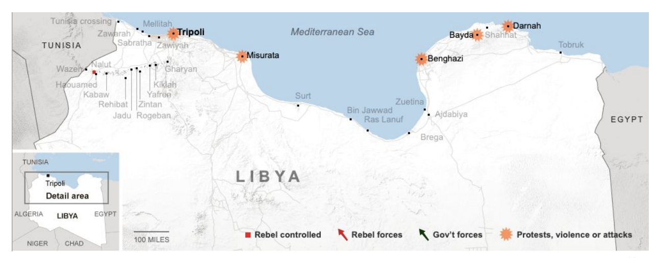
February 20th, 2011<sup>117</sup>

is little evidence to suggest that Gaddafi would not have been extremely violent in his treatment of civilians in upcoming conflicts and thus preventing further violence was necessary. 116