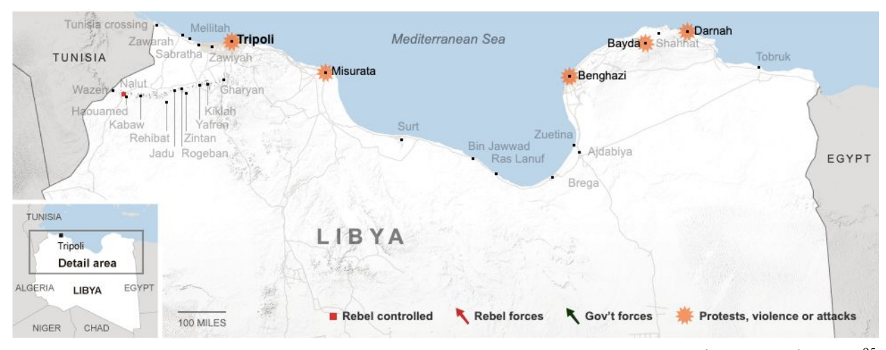
February 20th, 2011<sup>95</sup>

Under Gaddafi's orders, Libyan troops moved across the state, leaving carnage in their wake. If Gaddafi's forces were harming civilians in initial battles, then one can presumably make the case that treatment of those in Benghazi would be equally as violent, if not worse. Benghazi was the headquarters of the rebel government and the site of the revolution's beginning after the arrest of Fethi Tarbel. Thus, it is highly possible that the city would have faced a severe punishment for its primary role in challenging Gaddafi. As supporters of Operation Unified Protector frequently cite a threat to Benghazi in support of the intervention, establishing a pattern of violence will provide the foundation for a claim about the threat to Benghazi.